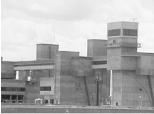
Figure 1-2. Melvin Price Lock central control house